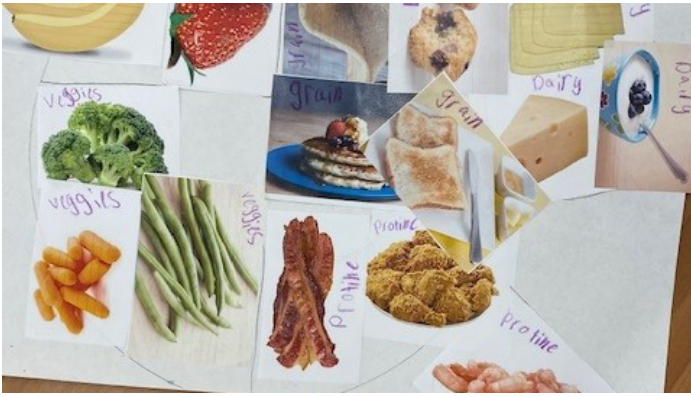
food collage made by 21st Century students