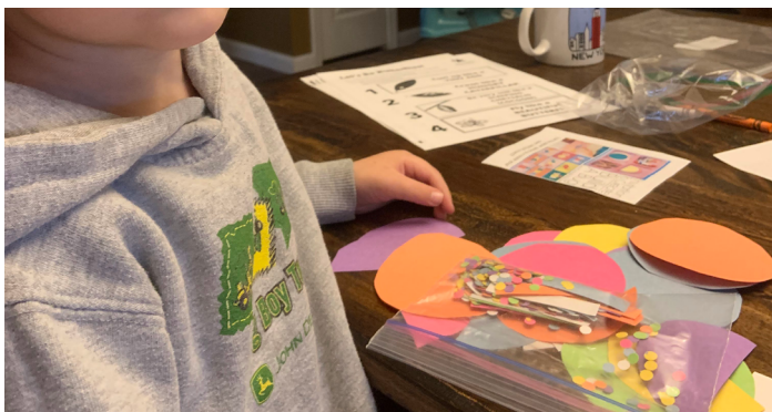
Laugh and Learn Kit participant learning about bugs and butterflies.