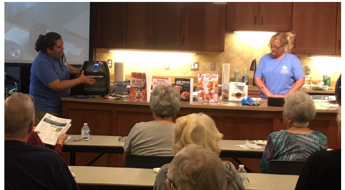
Air Fryer Class Participants

At Brooksville Childcare, teachers in the various classes are using the garden to educate children on the importance of healthy eating. According to one teacher the children rush to the garden as soon as they get outside and are amazed to see it grow! The Brooksville Senior Living apartment garden is allowing residents to have access to fresh produce they would not be able to get because of limited transportation means.