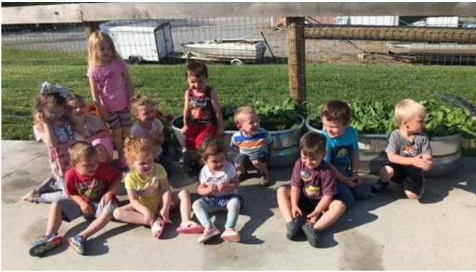
Local daycare enjoys gardening project.