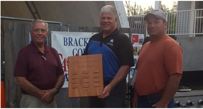
Hay Contest Winners