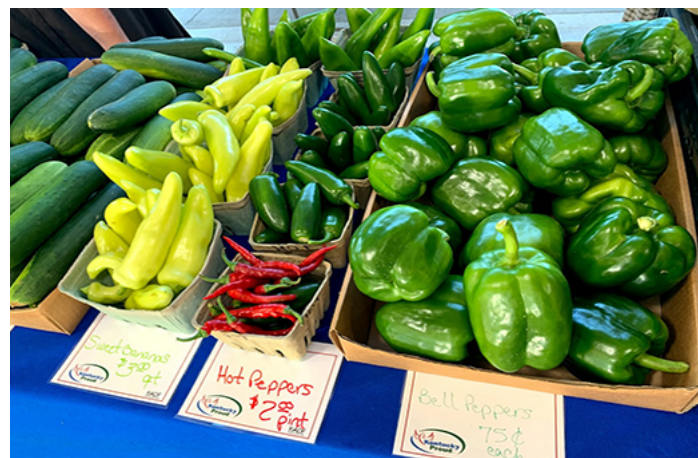
Summer's Fresh Produce at Farmers Market.

Youth participants received project supplies to follow along with lessons taught virtually. Results indicated youth gained a better understanding of plant needs and all youth indicated they started their own garden at home. Also, they could explain the benefits of the Farmers' Market, and tried a new fruit, vegetable, or herb. Eighty-six percent of youth tried the recipes demonstrated and all reported an increase in summer reading. 4-H Youth Learn by Gardening.