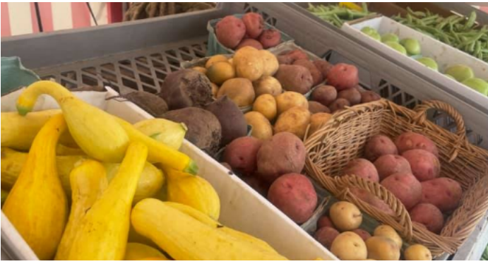
Fresh produce on display at the Casey County Farmers Market

10 Number of producers who were successful in marketing/selling food products