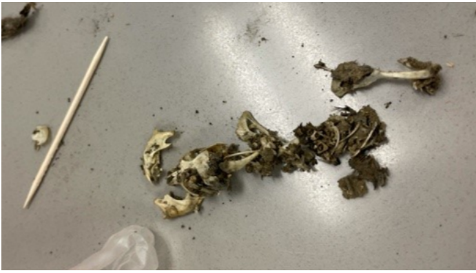
Bones one student found in their owl pellet