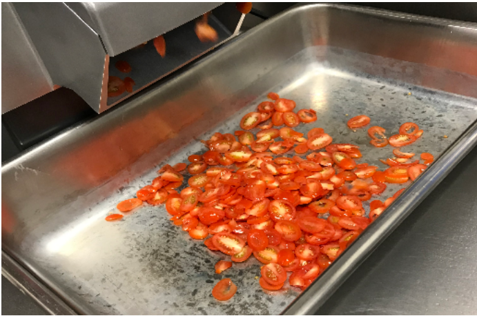
Robot Coupe in action at Cumberland County Middle School.