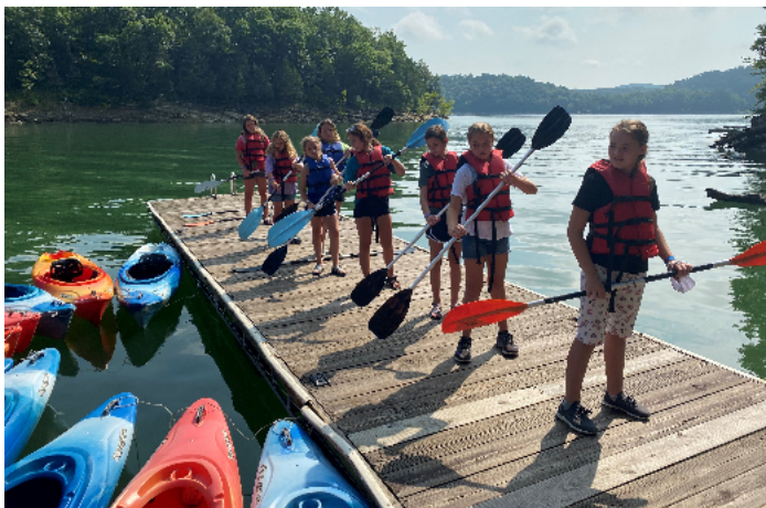
Youth learning how to use a paddle correctly.