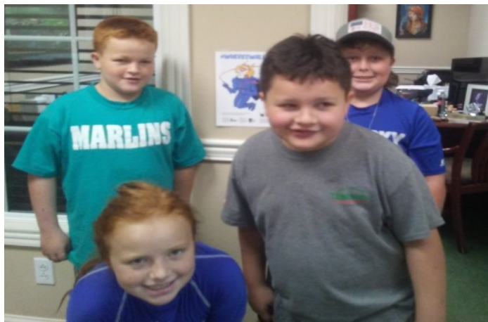
Where's Wally Cat Poster in Local Bank.

The funding decisions were made in response to obstacles that have prevented individuals from attending camp, including groups who are marginalized because of race, language, economic status and other key factors. As stated by UK President Eli Capilouto, addressing access and equity requires commitment. It requires partnership. (2021). All camp spots allotted for Cumberland County (36) were filled.