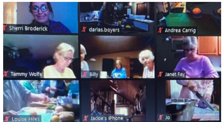
A computer screenshot of several of those learning to cook.

Hartig Park and Wildlife Reserve is 530 acres of natural beauty. When the County Judge Executive first approached Extension to seek help in converting this piece of property into a functioning county park, one of the first things he said was, "Of course, we don't have much money". And that's when we'd need lots of volunteers. Gallatin Extension sought out interested people from all across the county. At first, only a few answered the calling. But as the park became more popular, other folks (from as far away as Cincinnati, OH) have called to find out how they could help. Our local Boy and Girl Scouts have completed some great projects at the park as well. Volunteers have contributed over 2,250 hours of their time to Hartig Park. Using the current national value of volunteer hours, this equates to nearly $65,000! Many of these fine folks have become much more than just volunteers; they have bought into the park's mission!