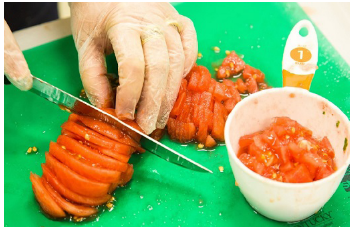
Participants are taught to eat healthy fruits and vegetables.

As a result of the program, 100% of participants reported eating more healthy foods such as whole fruits and/or brightly colored vegetables, while 100% prepared more healthy home cooked meals. In addition, 100% adopted one or more practices to reduce food shopping costs associated with home cooked meals such as comparing prices, planning meals, and making shopping lists. Over the long term, these cooking and eating behavior changes may lead to sustainable changes in cooking and eating norms in a community.