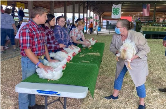
4-H poultry project judge interacts with youth at 2021 county fair.