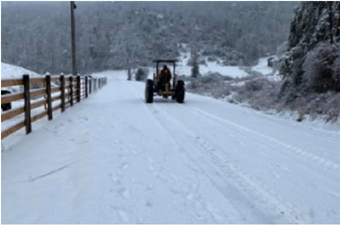
Crews plow roads after devastating ice storm.