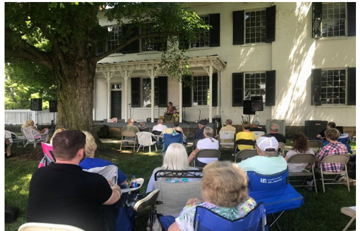
Audience enjoys traditional Appalachian folk music.

4-H Livestock is one of the biggest 4-H programs in Greenup County. Because of strong partnerships between the Greenup County Extension Service, 4-H Leaders, FFA, Fair Board, Fiscal Court, and Health Department, the shows and sales were able to happen with a successful outcome that benefitted local families. Overall livestock project participation numbers were up from 2020 with 73 livestock projects exhibited and sold in 4-H and FFA categories for a total sale of $116,728.35. Our participation numbers were still lower than past pre-covid years, but the sales were up.