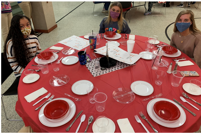
Students practice professional etiquette during the Adulting series.