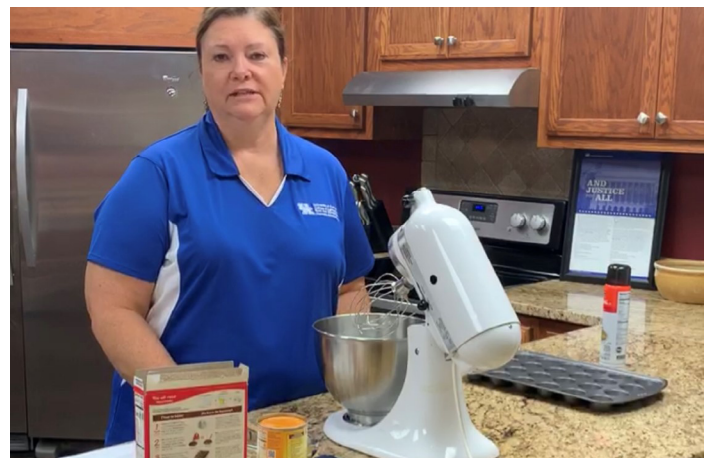
Dodson teaches via Facebook Live during pandemic.