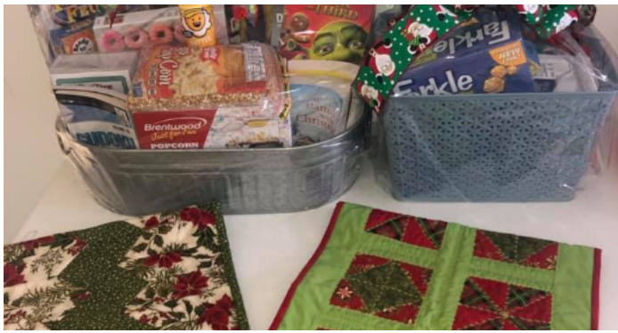
Items made & donated for auction (additional items not shown)