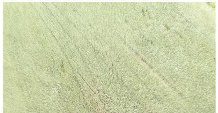
Overhead look of small grain field for straw production

The District 1 ANR Agents hosted a virtual Master Haymaker program series for seven weeks in February of 2021. Due to COVID-19 restrictions and the need to continue programming that would enhance the lives of agriculture producers in Eastern Kentucky, the Agriculture/Natural Resource Agents in District 1 planned and implemented the virtual program to help area producers have the resources to produce high-quality hay for livestock. Due to varying internet capabilities in the region, the option was given to either attend sessions via ZOOM or watch recordings via DVDs. 95% of the 124 registrants opted to join via ZOOM with approximately 70% of the ZOOM registrants attending all seven sessions. The seven sessions covered topics such as weed control in forages, producing quality hay, warm and cool-season forages, soil fertility, marketing hay, machinery options for hay production, and the production of baleage.