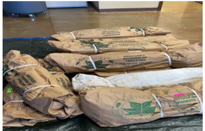
Free Seedling Giveaway

Planting trees provides a multitude of benefits to local ecosystems. These benefits include protecting soil from erosion, protecting water quality, increasing infiltration rates, and providing long term wildlife habitats. In partnership with the McCracken County Soil Conservation District, the McCracken County Cooperative Extension Service hosted a free tree seedling giveaway open to all residents. Three thousand seedlings were distributed at no cost to McCracken County residents. Varieties distributed included persimmon, Shumard oak, cypress, shagbark hickory, pecan, and yellow poplar. Participants were also provided with educational resources related to planting and soil testing. Participants described their appreciation for the program and the services that the Cooperative Extension Service provides to the community. This program resulted in community wide exposure to new and nontraditional Cooperative Extension Service clientele.