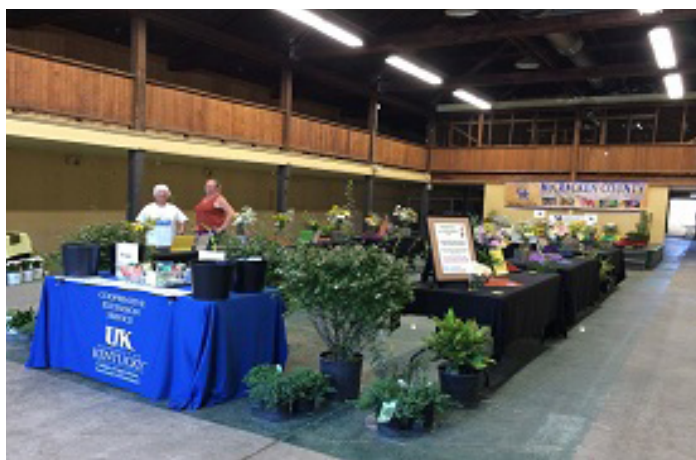
McCracken County Fair 2021

1700 Number of volunteer service hours completed by Extension Master Gardener Volunteers in the county