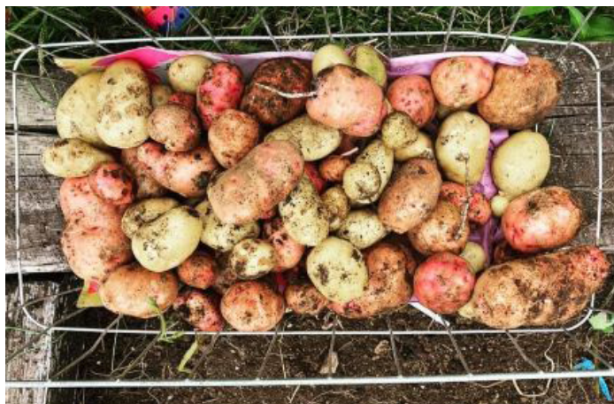
Grow Appalachia Potato Harvest.

McCreary County Extension has partnered with the Scott County, TN Extension Office and Scott Christian Care Center for several years to implement the Grow Appalachia Program through Berea College for both McCreary and Scott County residents. The mission of this program is to provide garden resources and classes, technical assistance to farmers and market gardeners, and facilitate a network of organizations and leaders working to support food security across the region. The classes held this year included Soil Testing and Garden Planning, Organic Gardening, Beneficial Insects, Food Preservation, Healthy Cooking, Extending the Growing Season, Fall Gardening, Successes & Failures, and Edible Landscaping. We were able to provide soil testing, fertilizer, gardening tools, seeds, plants, tilling assistance, and beginning gardening education to 76 program participants. All participants reported learning a new skill associated with this program.