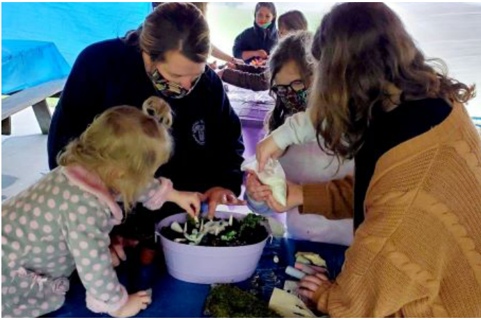
Fairy Gardens Class 2021.