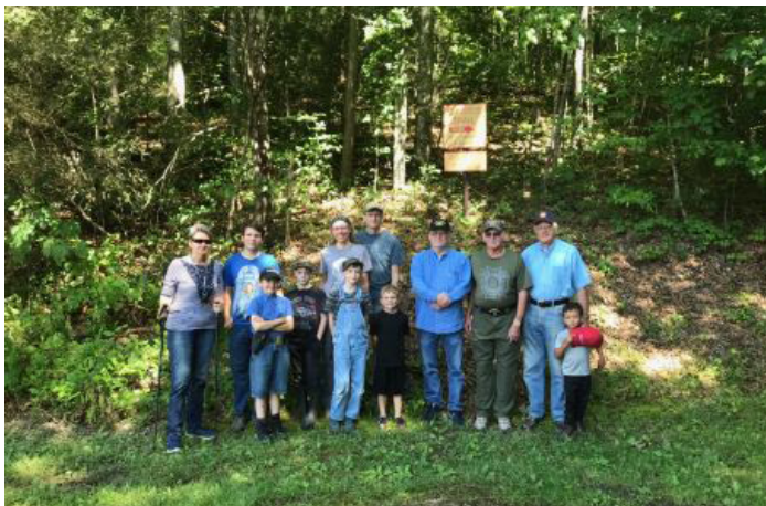
Campus Trail Group Hike.