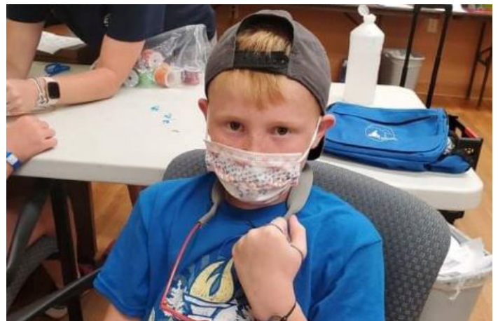
Camp Health Rocks!

The Fairy Garden class was focused on educating adults on the importance of quality time with children and providing the opportunity for parent/child interaction. Parent and child/children were taught the importance of communicating and spending quality time together. Participants were encouraged to use teamwork, communication, and creativity to create unique fairy gardens for each family. Parents indicated they enjoyed spending time together. Youth indicated an enjoyment of working with parent/caregiver. All participants demonstrated the skills taught to create a fairy garden and to communicate and work together as a team. One youth participant went home and made an additional three fairy gardens to give as gifts to grandparents for Mothers Day.