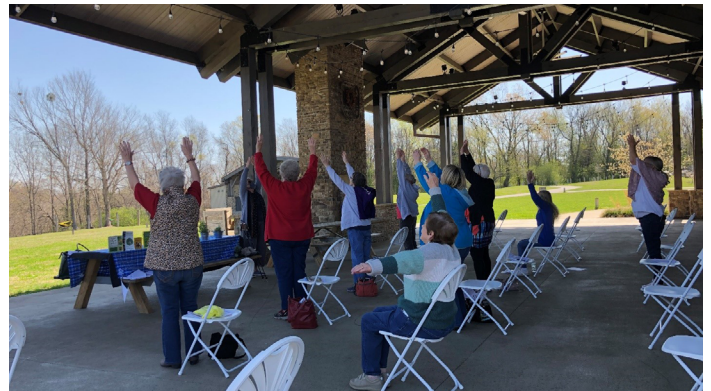
Gardening and Outdoor Activity for Physical and Mental Healthiness

This practice of cultivating, processing, and providing food for their family has been a great family building time. The youth have reported how rewarding it is to be able to eat food that they have grown. They also reported 96% learned how to care for the plants and prepare a meal.