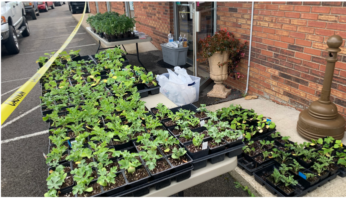
Go Garden Success