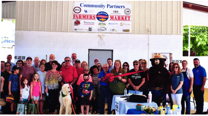
Metcalfe County Farmer's Market