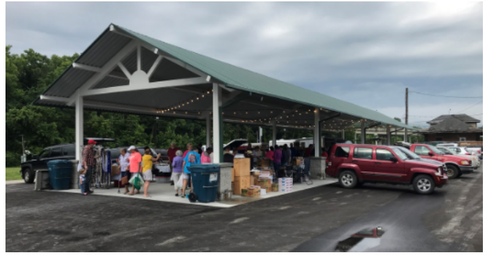
The New Pavilion was built by the city as the new home for the Farmers Market.

The Farmers' Market provides an economic benefit & healthy nutritional role to our citizens. Its leadership has made great strides to improve the shopping experience of its customers. A new Pavilion was built by the City to accommodate the sales of the Market. This pavilion provides a clean, attractive & easily accessible location for the customers. The Market has accepted WIC and Senior Coupons for many years. Most recently its leadership has applied for & received grant funds to hire a Market Manager & to offer Double Dollars Coupons to both the WIC & Senior Benefits. The Market is now able to receive customers SNAP benefits & to offer Double Dollars on those as well. The Market has created a website & Facebook page to better inform its customers about what vendors will have each day and to promote Market events. The Market leadership with the help of the Extension Service has done an outstanding job improving this community venue.