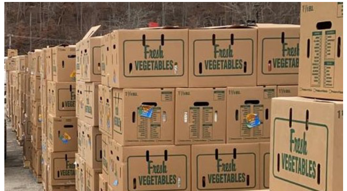
USDA Food Boxes

Three-hundred and eighty Master Loggers were able to receive six hours of continuing education to maintain their Master Logger Designation. Feedback from the loggers indicated that this program was successful. One participant stated, "The content and segments were great, this was the best master logger program that I have attended in all my years of being a master logger." WebTV worked so well that we plan to utilize it more in the future.