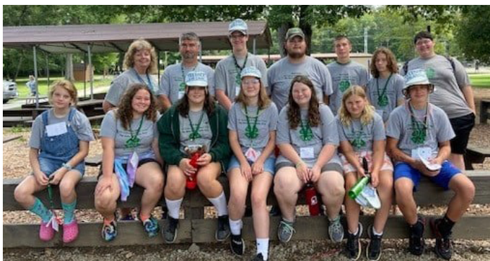
Perry County 4-H'ers at Summer Camp 2021