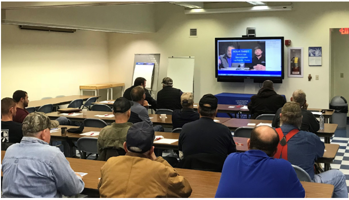
Master Logger WebTV Program