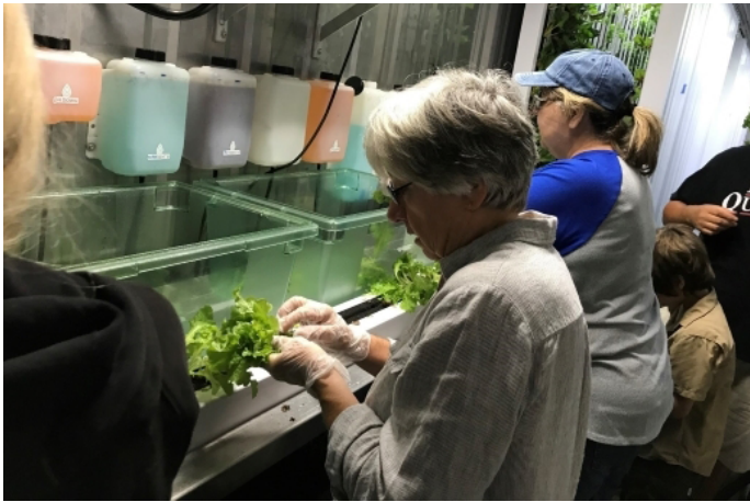
Pikeville Master Gardeners demonstrating hydroponics at the AppHarvest Program.