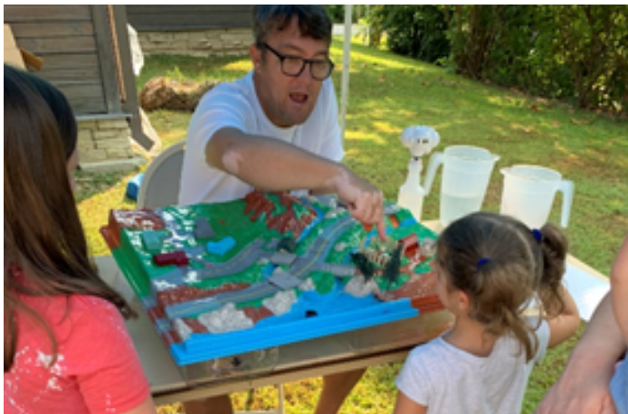
Powell CEA teaching youth about water pollution

40 Number of people who developed or updated an Ag Water Quality Plan