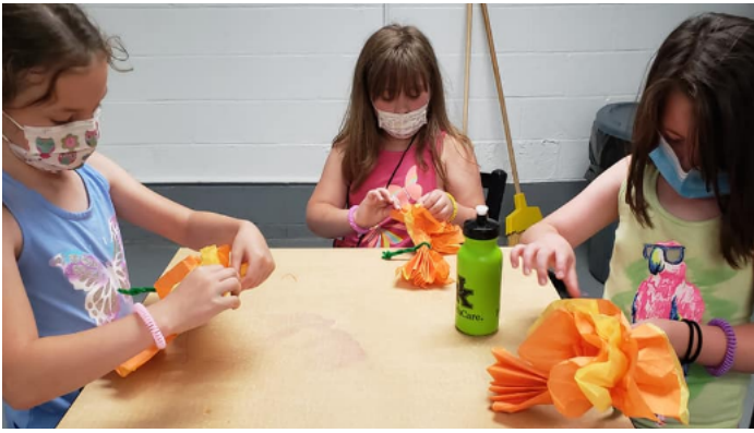
Cloverbud participates enjoying flower making.