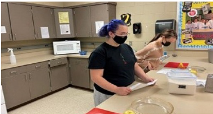
Youth Learning to Cook Together