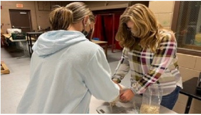
Seed give away.