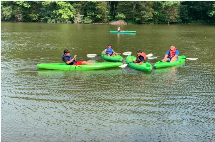
Participants canoeing at 4-H Camp.