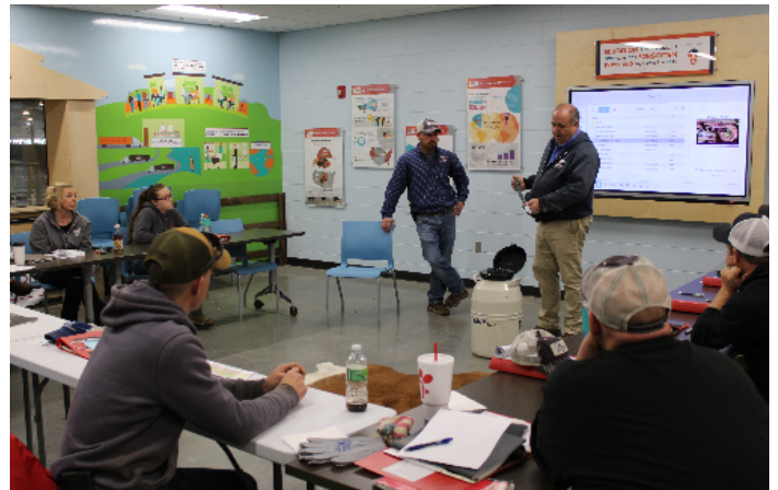
Participants learn at Artificial Insemination School.

In 2021, we were allowed to conduct camp with 50% capacity, which allowed Scott County to bring 92 to camp, with more on the waiting list. Camp is beneficial because it gives youth the opportunity to try new things and make lifelong friendships in a safe environment. In a time when social interaction is limited, it was nice to be able to provide æCamp Magic for youth this past summer.