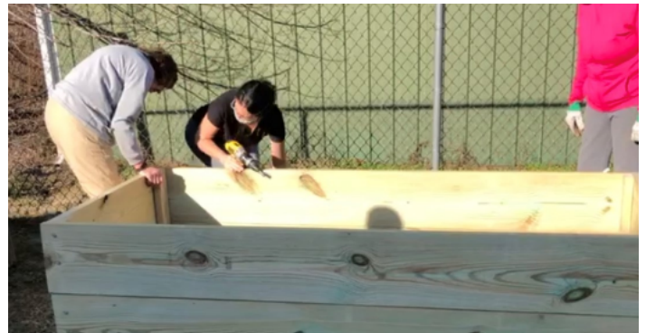
Master Gardeners are seen constructing a wicking garden bed.

COVID-19 brought many challenges to the horticulture program last year. Programming had to adapt to accommodate these challenges. The horticulture agent presented a Zoom webinar this spring on how to build a wicking garden bed. Master gardeners worked together with the agent to build it. The horticulture agent presented the building process to 169 individuals watching via Zoom through the State Horticulture webinar series. Finally, a class was taught in partnership with the local library on the building of the bed and on proper planting. The use of a hybrid in-person and Zoom teaching method resulted in maximizing the amount of people outreach through this program.