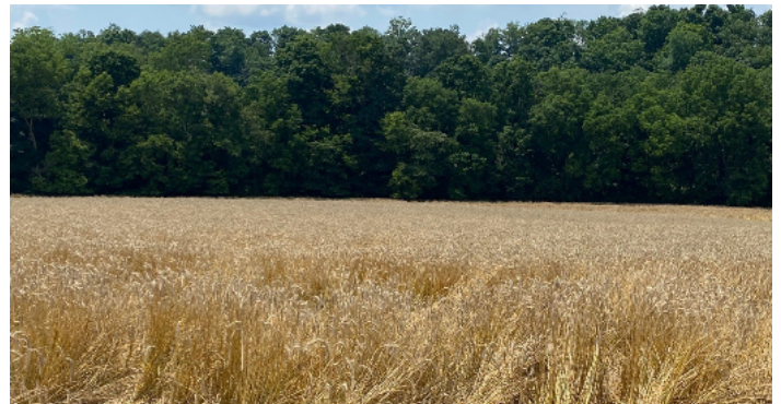
Rye plot before harvest.

Cereal rye in Kentucky is known as a cover or silage crop. On-farm research through the Kentucky Commercial Rye Cover Crop Initiative is being conducted to test agronomic practices to demonstrate if Kentucky can be a reliable source of rye for distillers, millers, and bakers. Temperature and humidity are two climate parameters which greatly affect quality and yield during pollination and grain fill. To record these parameters, the Taylor County Extension Service purchased a weather station and placed it at the pilot project field on a producers farm in Taylor County. The agriculture agent, in cooperation with the producer, is recording data and making agronomic notes as to help gather information for the initiative. Hopefully, the rye initiative will prove quality rye can be grown in Kentucky in a profitable and sustainable manner. Producers need alternate crops to further diversify and furnish end users Kentucky rye.