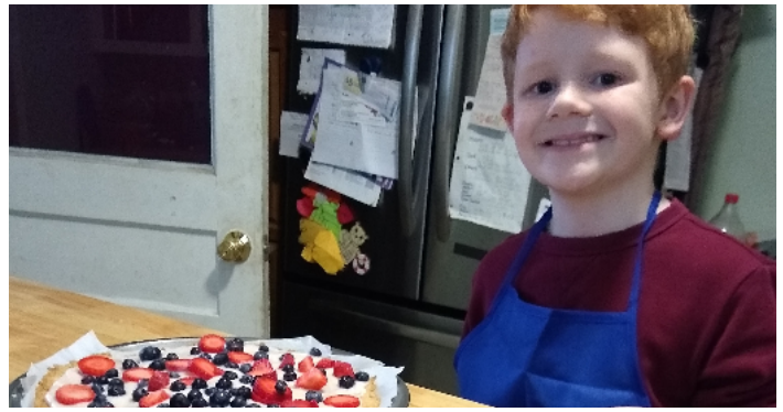
A delicious fruit pizza made via zoom during a lesson.

The Nutrition Education Assistant in Taylor County was looking for ways to offer classes virtually during the pandemic. The Healthy Choices for Every Body lesson Ready, Set, Cook! was the starting point for a bi-monthly class series held via Zoom. Classes were promoted through Facebook, Interagency Council, the housing authority, Adanta's counseling programs, Skills U, and the local pregnancy center. Several families as well as single adults enrolled and were provided with printed lessons, recipes and reinforcement kitchen tools for each lesson. The Nutrition Assistant did door drops with the supplies prior to class. Families often cooked together along with the assistant's demonstration. Sometimes families weren't able to log in, but they reviewed the lessons and sent pictures of the dishes they had prepared. With families cooking together in the kitchen, it was often a lively and noisy meeting.