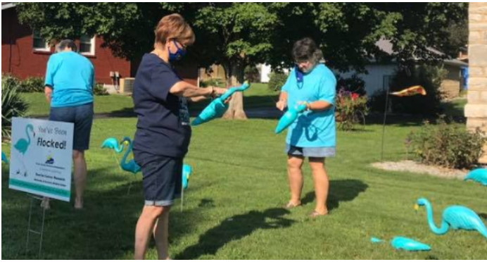
Taylor County Homemakers flocking a home.