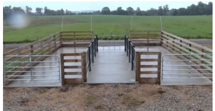
Heavy use feeding pads for livestock producers.

One of the challenges of the pandemic for Extension Agents is how do we continue to deliver quality educational programs to our clientele during this health crisis. Ag agents collaborated on the Area Virtual Field Day. Ear corn production for hunters, high tunnel strawberry production and livestock feeding pad for high traffic areas were highlighted during this field day. The virtual field day was held using Zoom. After each farm video was shown, the 112 attendees were able to ask questions of the presenters. The virtual field day was recorded and has been uploaded to YouTube so it can be accessed for other educational opportunities. People were able to participate remotely and still gain valuable knowledge. 100% of the respondents to our survey indicated they learned something that will benefit them. Over 96% rated the virtual field day as an excellent program, and 28% indicated they will make a change to their farming operation.