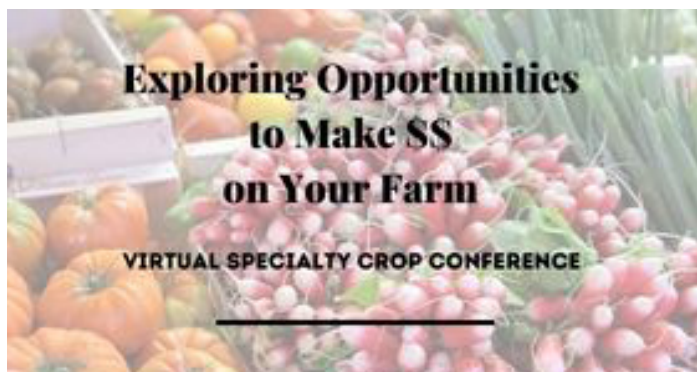
Virtual 2020 Specialty Crop Conference Logo

232 Number of people who used Extension resources in making decisions or employing best practices related to pollinators, and /or their habitats.