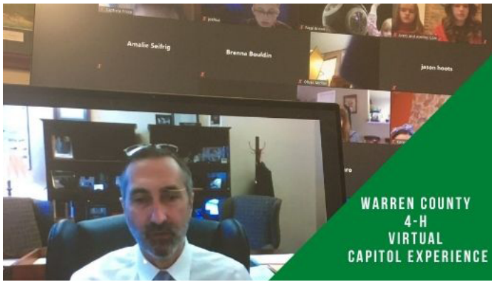
Warren County 4-H Virtual Capitol Experience.