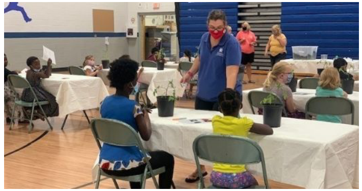
Planting tomatoes at a local Elementary school in Warren County.

According to the National Institute for Children’s Health Quality, Kentucky has one of the highest prevalence for pediatric obesity in the nation. Childhood obesity has both immediate and long-term serious health impacts. In an effort to fight childhood obesity in Warren County, the SNAP Education Assistant collaborated with local elementary schools in Warren County to teach students about healthy eating and gardening. The SNAP Education Assistant taught the Professor Popcorn Curriculum, and 88% of children improved their abilities to choose foods according to Federal Dietary Recommendations. Additionally, 58% of children now choose vegetables for their afternoon snack. Eight “five percent of children now use safe food handling practices. From the nutrition classes 70% of children increased their daily physical activity.