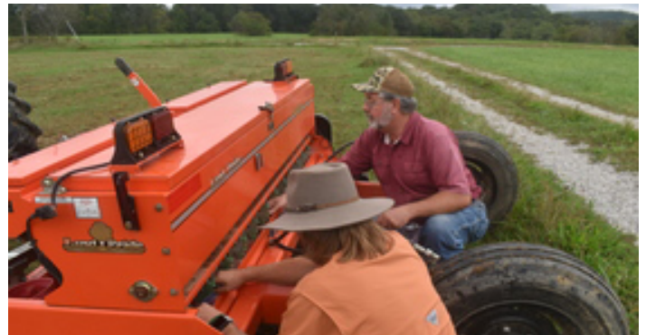
Adding seed to hayfields can improve yield.

Project packs have been a great way to reach new individuals in Whitley County and over 3,000 projects were distributed from three different sites. One of our projects was to make a home terrarium out of recycled materials, including instructions, soil, seeds and recycled bottles. Youth learned about the water cycle and how materials can be reduced, reused and recycled. They also learned about watersheds and grew beautiful flowers in their terrariums. Project packs ranged from natural resources, environment, wildlife, pollinators, food & nutrition, and much more. Members met at Ballard Ford River Access to learn about watersheds. Youth participated in KY Stream Team studies that consisted of conducting chemical testing, collecting and identifying insects, and stream exploration. Using the KY Water Health Portal, we identified the streams in our county, collect stream samples and reported the data to the Watershed Watch website.