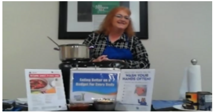
Zoom Class for Eating Better on a Budget

As Extension Program Assistants, one never knows what hurdles they may have to cross. At one facility the Nutrition Education Program (NEP) Assistant partners with, the hurdle for the year was getting used to and working with three different directors and wanting each transition to go as smooth as possible for both the clients and director. The only way to achieve this would be to teach clients patience during changes, and to take ownership of the nutrition classes she teaches them from the Healthy Choices for Every Body curriculum.